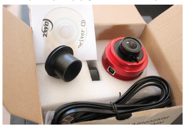
The ASI camera head and supplied accessories. The small 150-degree wide angle lens is an especially nice inclusion and also offers the possibility of employing the camera as an all-sky camera.