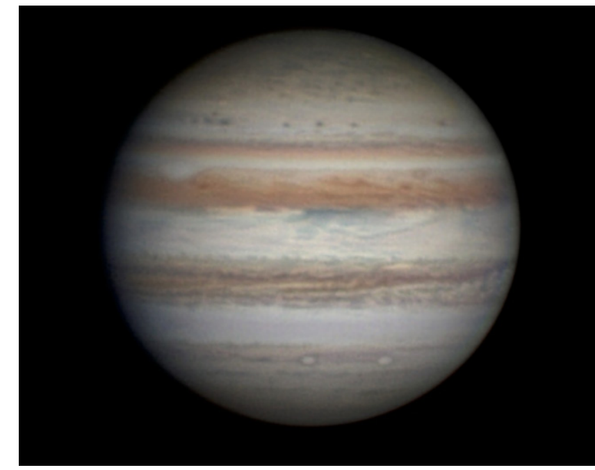
▲ Jupiter, as imaged by the camera on a 355mm telescope. Jupiter was far past opposition and presented a tough challenge low in the western sky at sundown. Despite this the ASI did an excellent job.