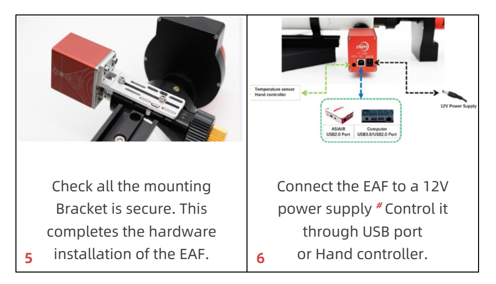
# 5.5*2.1mm, center positive, 0.5A and up required